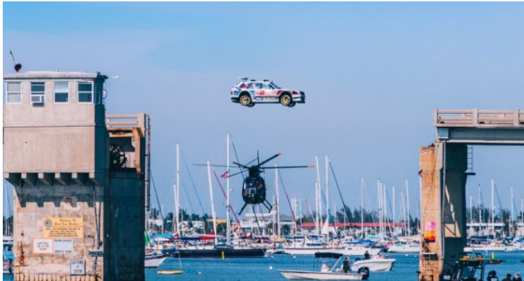
A still from a Gymkhana video produced by Hoonigan

27. Sales. Hoonigan provides a best-in-class customer experience and offers one of the best selections of premium automotive aftermarket products in the categories the Company competes in. The Company’s